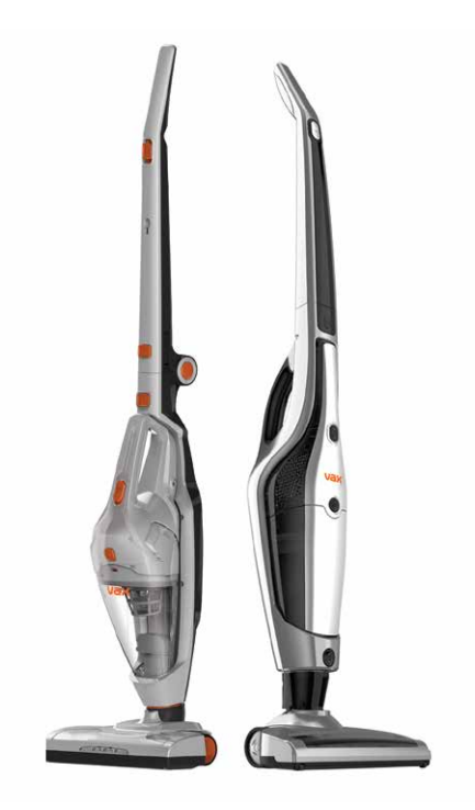
Dynamo Cordless & Dynamo Power Cordless

2015 proved to be an exciting year for VAX<sup>®</sup> where product development was focussed on bringing real innovation to the hands of consumers. VAX<sup>®</sup> became one of the leading Cordless vacuum brands in the UK. TTI's expertise in battery technology enabled expansion and innovation in the range including the UK's first Cordless lift-out, delivering superior customer experience and driving success for VAX<sup>®</sup> in the cordless category.