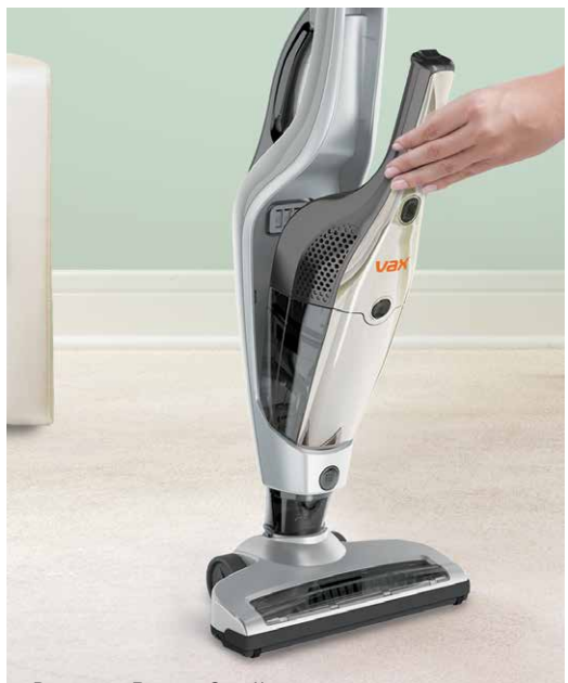
Dynamo Power Cordless