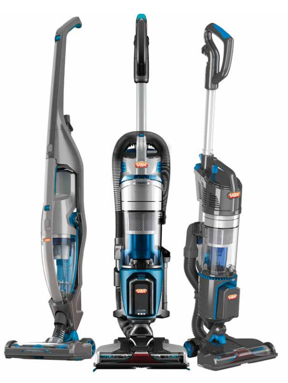
Air<sup>™</sup> Cordless Switch, Air<sup>™</sup> Cordless Lift & Air<sup>™</sup> Cordless