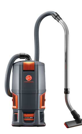
HUSHTONE<sup>™</sup> 6Q Cordless Backpack

We empower the cleaning professional with the tools to efficiently keep the commercial environments they maintain – clean, safe, and productive for the patrons and employees that depend on them. HOOVER<sup>®</sup> commercial floor cleaning products are idealy suited for the property management and hospitality markets.