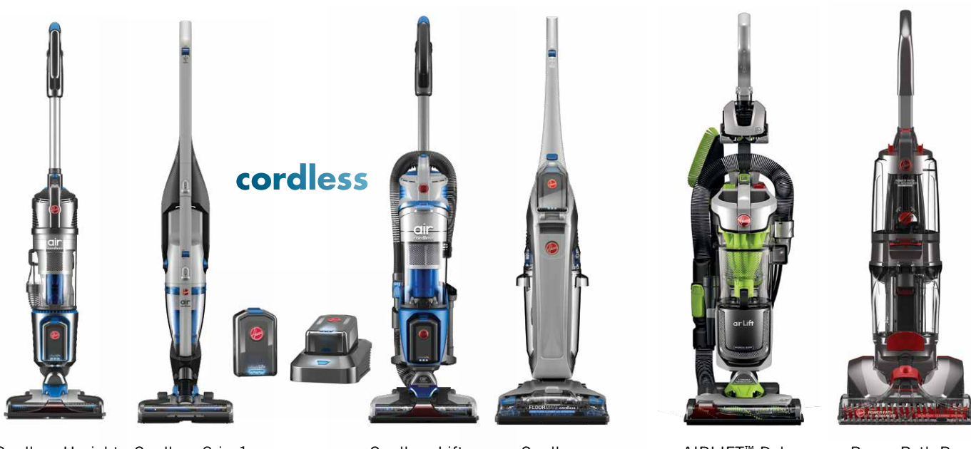
Cordless Upright Cordless 2-in-1

As America's most recognized vacuum brand, HOOVER<sup>®</sup> is committed to helping busy families find easier ways to keep their home clean. That's why we continue to innovate and create new products like our new family of cordless vacuums - changing the way America cleans.