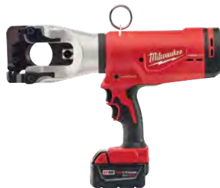
M18 FORCE LOGIC 1590 ACSR Cutter