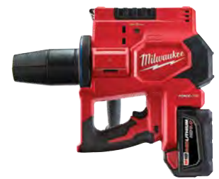
M18 FORCE LOGIC 2"-3" PROPEX Expansion Tool