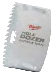
3-1/2" HOLE DOZER with Carbide Teeth Hole Saw