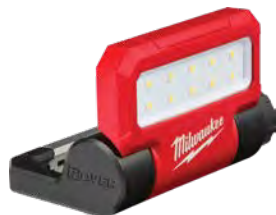
USB Rechargeable ROVER Pivoting Flood Light