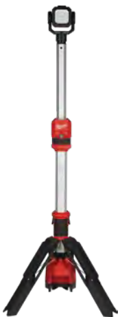
M12 ROCKET Dual Power Tower Light

MILWAUKEE site lighting is the industry's first system of high-output LED lights to offer full-day runtime in portable packages. The site lights utilize the most advanced lighting technology to deliver a consistent beam, optimized color temperature and true representation of colors and detail leading to a more productive work area. Our job site lights shine brighter, last longer and are uniquely designed to adapt, perform and survive the daily demands of professional use.