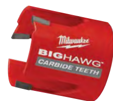
2-9/16" BIG HAWG with Carbide Teeth Hole Saw