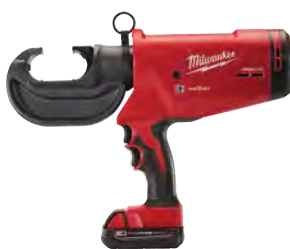
M18 FORCE LOGIC 750 MCM Crimper