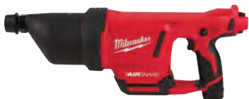
M12 AIRSNAKE Drain Cleaning Air Gun