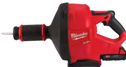
M18 FUEL Drain Snake w/ CABLE DRIVE Locking Feed System