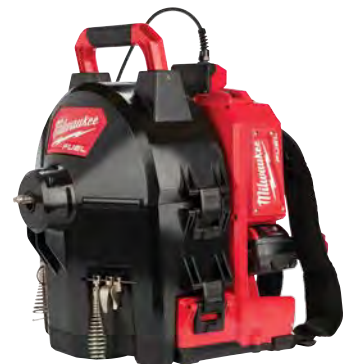
M18 FUEL SWITCH PACK Sectional Drum System Kit