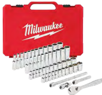
Ratchet & Socket Set