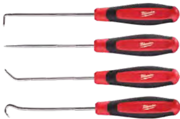
Hook & Pick Set