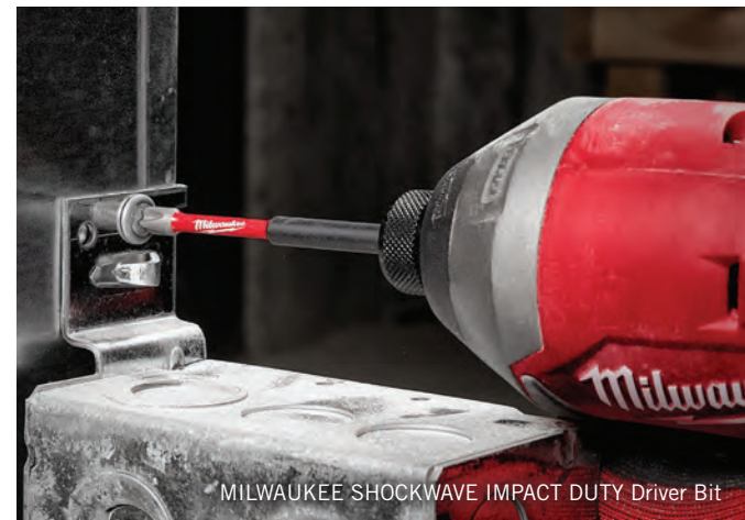
MILWAUKEE SHOCKWAVE IMPACT DUTY Driver Bit

Our MILWAUKEE high-performance cordless tools are increasingly powerful and technologically advanced. The MILWAUKEE Accessory business is focused on developing accessories engineered to optimize the performance on cordless tools.