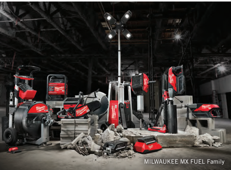
MILWAUKEE MX FUEL Family

Launching with 10 products, the new MX FUEL Equipment System is the platform that provides the technology and capability for MILWAUKEE to take a giant step into the light equipment space.