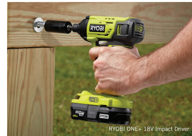
RYOBI ONE+ 18V Impact Driver

The RYOBI cordless business delivered double digit sales growth in 2019. After years of focused investment, RYOBI is now the global leader in DIY cordless power tools and outdoor cordless products with the 18V ONE+ and 40V Systems. The RYOBI brand is at the forefront of the cordless revolution disrupting the DIY industry with an impressive flow of new products targeting the remodeler, hobbyist, automotive and value oriented professional users to name a few. The RYOBI commitment to platform compatibility has inspired a loyal following of users and has driven significant household penetration.