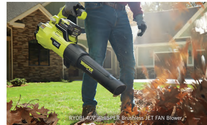
RYOBI 40V WHISPER Brushless JET FAN Blower

We are aggressively investing in a myriad of new ONE+ and 40V outdoor products. The new product pipeline in the 40V platform is the growth engine driving the expansion of the system. The entire 40V hand-held product range was updated for 2019, with the most significant launches including the attachment capable string trimmer, jet fan blower, hedge trimmer and a brushless chainsaw. Additionally, we launched two powerful new brushless self-propelled mowers on the 40V platform in 2019.