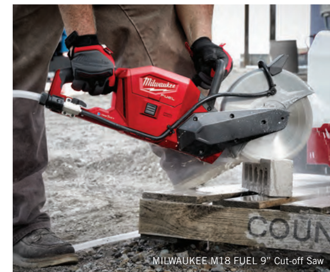
MILWAUKEE M18 FUEL 9" Cut-off Saw

MILWAUKEE remains focused on introducing new technology to support existing system users in addition to attracting new users to the extensive MILWAUKEE M12 and M18 cordless systems. The introduction of the M18 REDLITHIUM HIGH OUTPUT CP 3.0 and XC 8.0 battery packs offer 50% more power while running 50% cooler and delivering up to 60% more runtime. In addition, Milwaukee Tool continues investing and expanding the solutions in the FUEL brushless system enabling the conversion of alternate power sources while increasing safety and productivity on the jobsite. As an example, the M18 FUEL 9" Cutoff Saw eliminates the inconveniences in dealing with gas-powered cutoff saws while the M18 FUEL 7-1/4" Rear Handle Circular Saw delivers more power and faster cuts than an AC corded saw. The M18 FUEL 1" High Torque Impact Wrench is the world's first and most powerful impact wrench on the market enabling users to eliminate pneumatic hoses and cords on the worksite. The relentless dedication to the professional trades is evident throughout Milwaukee Tool's targeted industry verticals.