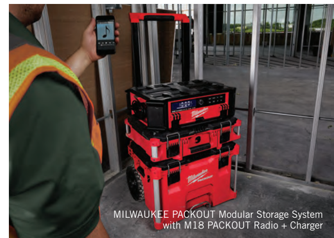
MILWAUKEE PACKOUT Modular Storage System with M18 PACKOUT Radio + Charger

In 2019, the MILWAUKEE Hand Tools delivered exceptional growth propelled by innovative new products. A range of innovative mechanics hand tools with best in class features rolled out in 2019. In addition, we have launched a breakthrough range of tape measures that feature industry leading performance.