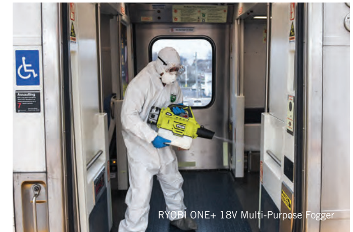
RYOBI ONE+ 18V Multi-Purpose Fogger

The RYOBI brushless range is gaining traction worldwide. The RYOBI power tool product development focus on the DIY user is set to expand the ONE+ System beyond today's 130 tools with continued innovation breakthroughs.