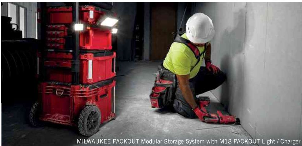
MILWAUKEE PACKOUT Modular Storage System with M18 PACKOUT Light / Charger

The MILWAUKEE PACKOUT storage system continues to expand to meet the professional's growing tool storage, transportation, and organizational needs. New innovations to the system of over 36 interchangeable products include the PACKOUT Customizable Work Surface, PACKOUT 16QT Cooler, M18 PACKOUT Light/Charger and PACKOUT 2-Wheeled Cart.