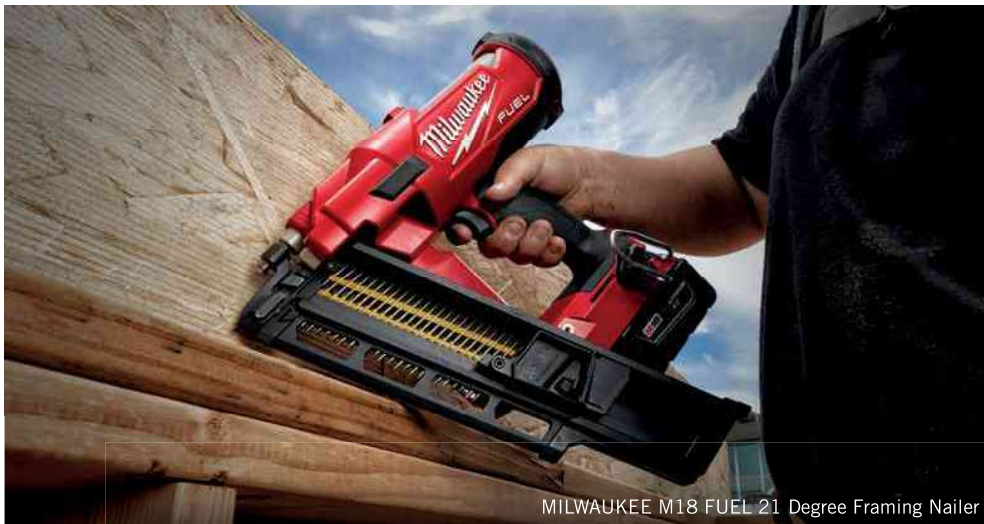
MILWAUKEE M18 FUEL 21 Degree Framing Nailer

delivers unmatched control and access, has the power to cut 3" hardwoods, and delivers up to 120 cuts per charge. This electric pruning saw is designed to meet the ergonomic, performance, and durability needs of landscape maintenance professionals.