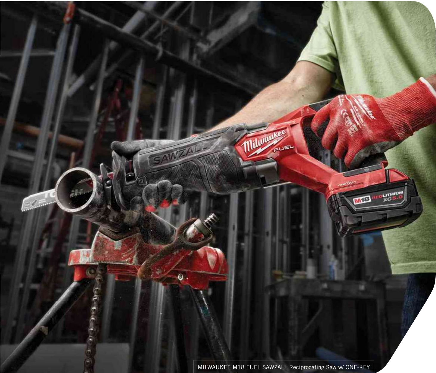
MILWAUKEE M18 FUEL SAWZALL Reciprocating Saw w/ ONE-KEY