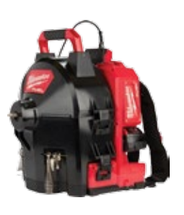
M18 FUEL SWITCH PACK Sectional Drum System Kit