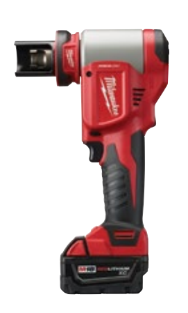
M18 FORCELOGIC 10 Ton Knockout Tool