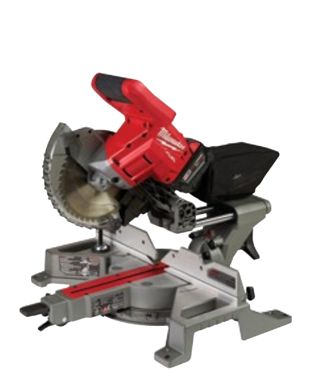
M18 FUEL 7-1/4" Dual Bevel Sliding Compound Miter Saw

As the flagship of the M18 system, M18 FUEL products deliver solutions that are the highest performing tools in their class. Engineered for the most demanding tradesmen, all M18 FUEL products feature three MILWAUKEE-exclusive innovations — The POWERSTATE brushless motor, REDLITHIUM battery pack and REDLINK PLUS intelligence hardware and software — that deliver unmatched power, run-time and durability on the jobsite.