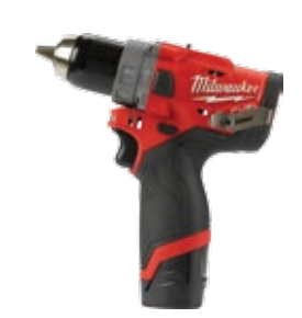
M12 FUEL 1/2" Hammer Drill/Driver