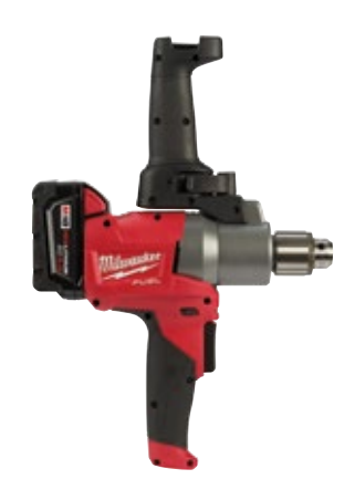
M18 FUEL Mud Mixer w/ 180° Handle